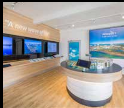
Retail & Sales Displays