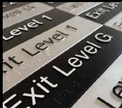
Statutory & Safety

We offer a complete range of signage solutions to meet any requirement. We custom design and create your brand and vision into high quality signage products.