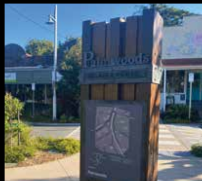
Landscape & Interpretive