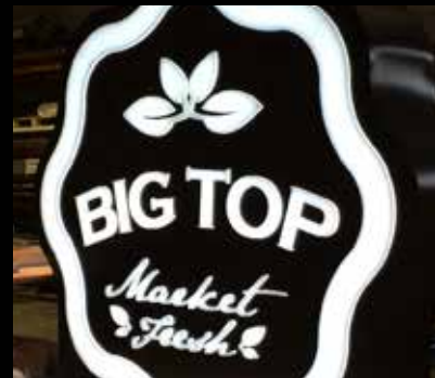
Illuminated & Digital