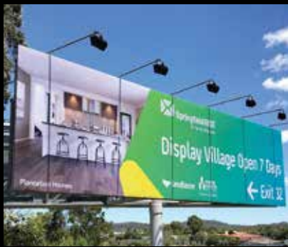
Billboards & Hoarding