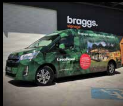
Vehicle & Fleet